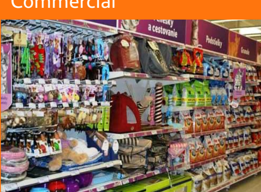
Buying better to invest for customers