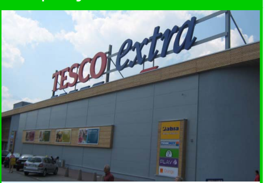
Extra, small formats, build for less