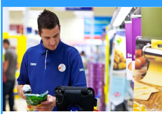
Innovating for customers